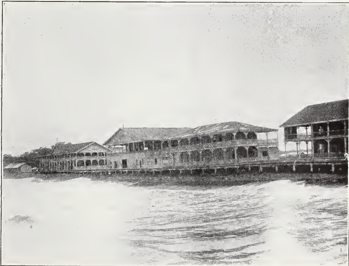
Port of "San Jose de Guatemala."